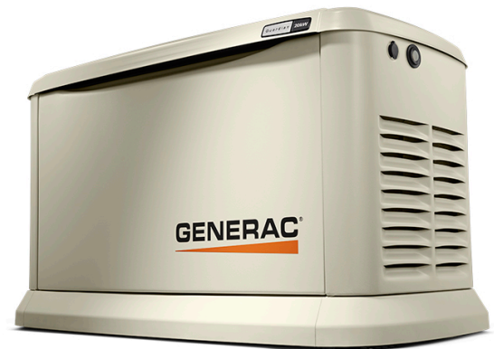
Product shown with optional fascia kit