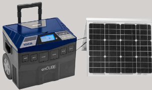
enCUBE battery inverter with 60-watt solar panel

With no engine or need for fuel, enCUBE battery inverter is a clean power source with zero emissions, which means it can be used indoors. It charges through a 120-V AC wall outlet or optional solar panel (sold separately) and is perfect for camping, tailgating or temporary outages at home. Built-in wheels and telescopic handles make it incredibly portable.