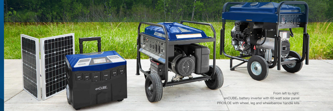
From left to right: enCUBE, battery inverter with 60-watt solar panel PRO, OE with wheel, leg and wheelbarrow handle kits